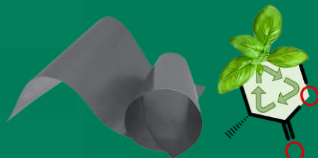
Polymers from Renewable Sources